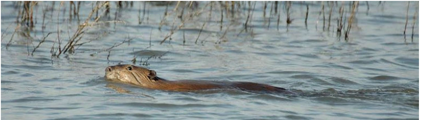
Photo from the new California Department of Fish and Wildlife website , which now includes links to the WATER Institute's resources like our publication, " Beaver in California: Creating a Culture of Stewardship ."