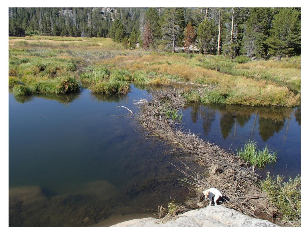
Figure 8. The typical "triangle" shape of a beaver dam with a wide base and narrow top to maximize stability and reduce stream flow. The size and arrangement of sticks within beaver dams is highly consistent and recognizable. Note the multiple flow paths and channels where the stream is backed up into a complex web of channels at a tributary. This dam was breached in winter 2017. Faith Valley, 2016.