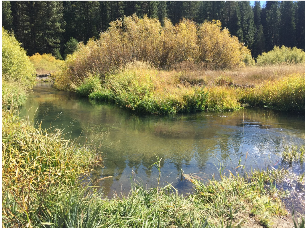
Figure 1. Just downstream from the location where the Beaver Dam remnant sample was taken. The bulging trapezoidal shaped bank on both sides of the channel indicates a buried remnant beaver dam. Beneath the sod and sedges, there are obvious remnant sticks visible under the waterline in the channel.