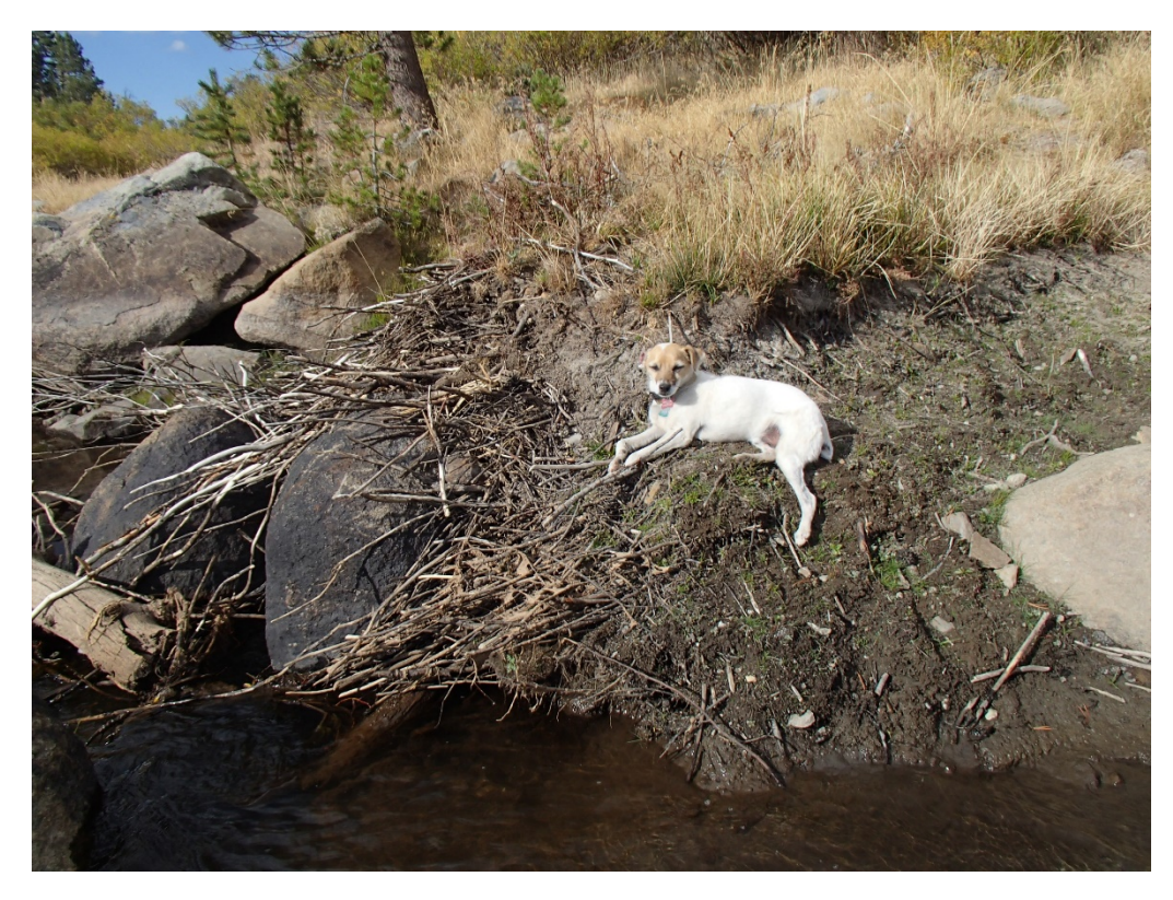
Figure 9. A large remnant dam with beaver sticks remaining in the bank. The size and arrangement is distinct and can be instantly recognized, especially with other clues from the geomorphic influence of the former beaver dam on the landscape. Faith Valley, 2016.