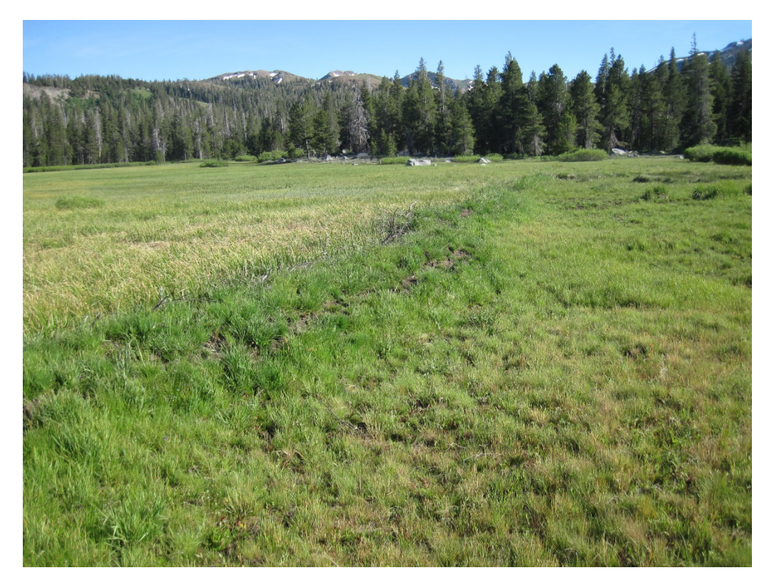
Figure 14. After the dam is breached, this small scratch dam extension across the meadow is left dry and the willows begin to sprout. Faith Valley, 2018.