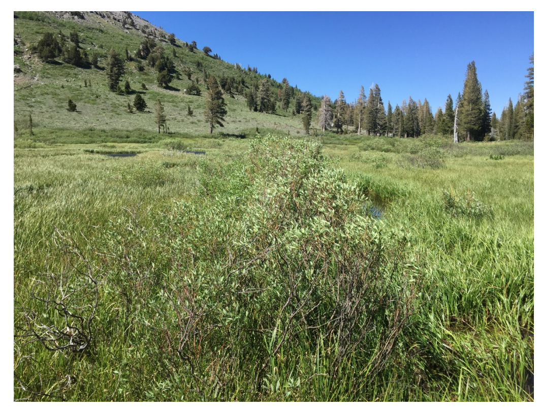
Figure 12. Sprouting willows from a low, cross valley scratch dam have a visually distinct "line" formation that I describe as beavers row cropping. Forestdale Meadow 2018.