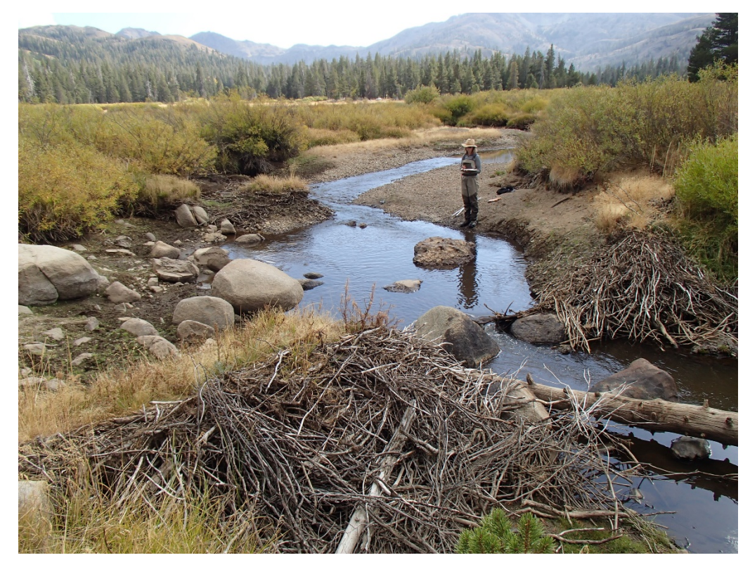
Figure 10. After the dam is breached, the geomorphology of the upstream channel shows the unmistakable influence of the former dam. Sediment deposition, sorting, and fine sediments accreted at the dam margins persist after the dam is no longer influencing the channel. Faith Valley, 2016