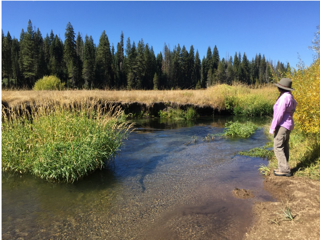
Figure 3. Remnant chunk of beaver dam with sediments accreted on top allowing for grass to colonize. The area where the person in the photo is standing was the emergent marsh habitat created by former beaver dams at this site in Tásmam Koyóm.