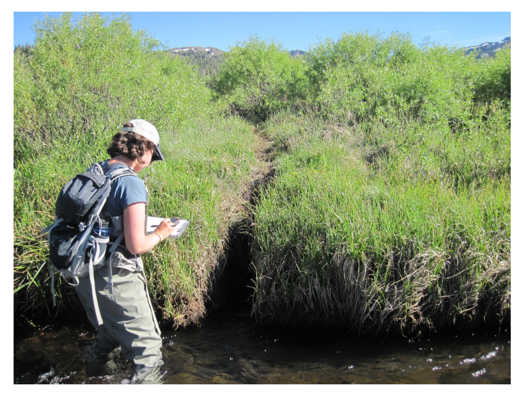
Figure 13. Beaver burrows and tunnels exposed after a dam breach leave a distinctive track that persists for a long period of time. Faith Valley, 2018.