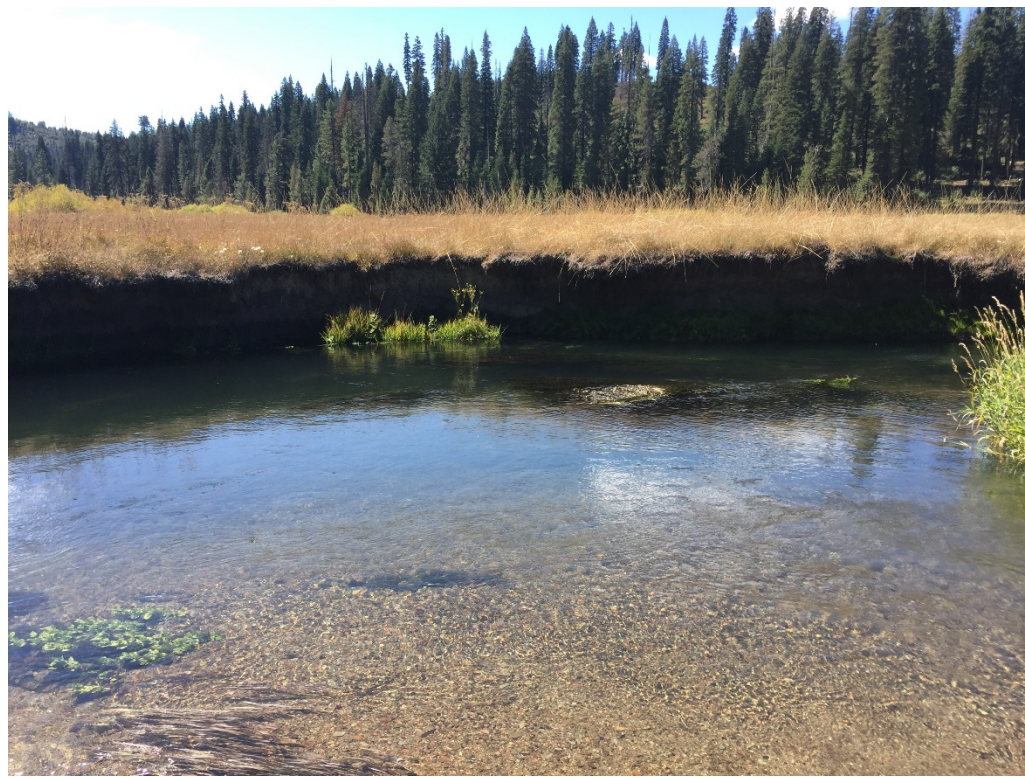
Figure 2. The remnant sample was taken from the cutbank pictured here near the small sod chunk across the stream channel. There are numerous other indicators of the earlier presence of beaver dams here including sod islands, and the remnants of the emergent marsh habitat created by the dam on river left.