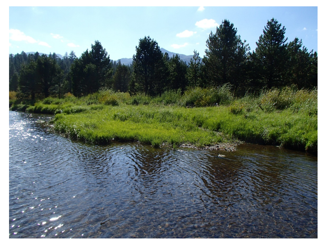
Figure 6. The beaver dam here is long gone but the inset floodplain development that occurred due to presence of the dam generating emergent marsh habitat persists and indicates the earlier presence of the dam. Dam remnants at the channel margins confirm the presence of an earlier beaver dam. Photo from Hope Valley 2017.

Figure 5. A remnant dam along the channel. Note the distinctive wedge shape created by the dam itself and the fine sediments leading to emergent marsh habitat on both the downstream and upstream side of the dam. When dams are partially breached like this one, they often create a scour pool where the dam once was. This geomorphic evolution can be observed consistently throughout Sierran Meadows and the landform is very distinctive. Hope Valley, 2017.