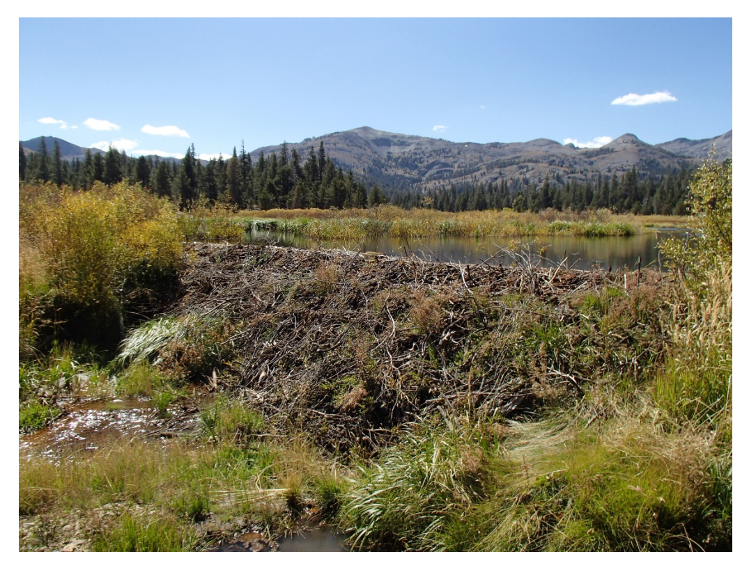
Figure 11. It is common for beavers to repeatedly build large dams at the same site, particularly at confluence areas where the area of inundation can be very large. This dam was breached in the winter of 2017 and exposed dozens of remnant dams in the same area. Faith Valley, 2016