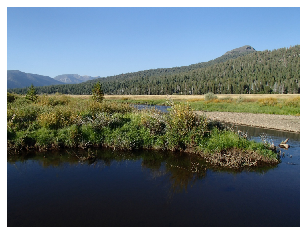
Figure 7. The beaver dam here was end cut by water creating a distinctive backwater and stream bend pattern that can be seen (and continues to evolve) ubiquitously in Sierran Meadow streams that have had beaver present. Photo from Hope Valley, 2017.