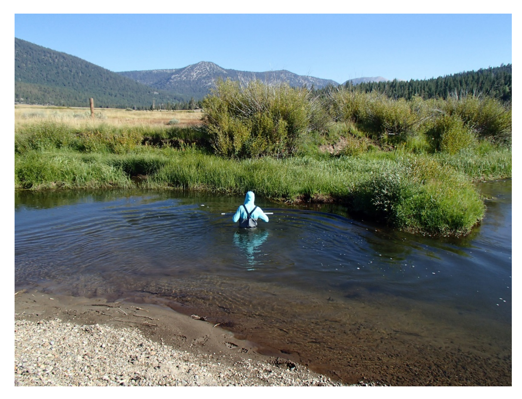
Figure 5. A remnant dam along the channel. Note the distinctive wedge shape created by the dam itself and the fine sediments leading to emergent marsh habitat on both the downstream and upstream side of the dam. When dams are partially breached like this one, they often create a scour pool where the dam once was. This geomorphic evolution can be observed consistently throughout Sierran Meadows and the landform is very distinctive. Hope Valley, 2017.