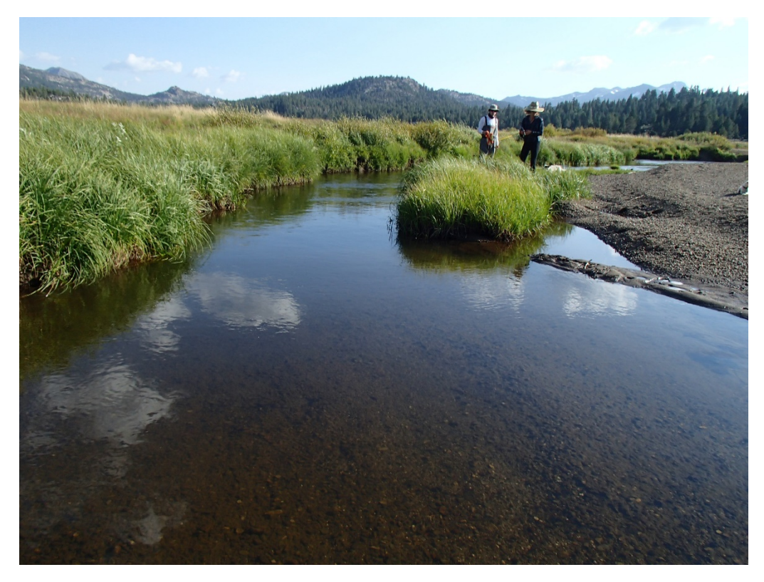
Figure 4. Typical "Beaver shaped banks" in Hope Valley, CA, 2017. The shape and vegetation cover are very typical of the area upstream of a beaver dam that remained in place for several seasons allowing sediment deposition upstream of the dam and stabilization of banks due to a higher water table and reduced stream velocity. This distinctive bank shape can persist long after the beaver dam that created them has washed out. A partial dam remnant can be seen in this photo mid-channel with telltale beaver sign sticks at the base.