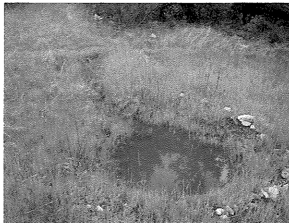
A contour swale, or infiltration ditch, with an ephemeral pool at one end. Located in a wildland setting at the Occidental Arts and Ecology Center, it was installed to intercept excess stormwater, allow it to soak into the slope, and reduce gully erosion.

development. In Seattle's "Street Edge Alternatives," winter rains are captured in gently graded bioswales that have been planted with flowering perennials along the street's margin; the straight street has been given a sinuous curve to slow down traffic. In Portland, Ole Ersson captures rainwater from his roof, and keeps his family of four in drinking water year-round. In the Glencoe Raingarden in Portland, petroleum-polluted parking lot water is biofiltered with sedges and allowed to recharge the ground-water. At Cabrillo College in Aptos, California, the landscape around the buildings and parking lots of the new Horticulture Department includes a retention pond to collect storm-water; there, it is bio-