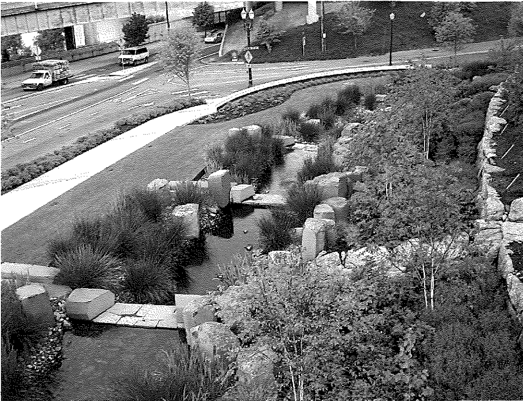
A portion of the rainwater garden, which collects rainwater from the roof of the Portland, Oregon, Convention Center; the water is slowed down and allowed to percolate into the ground, rather than being shunted into the city's sewer system