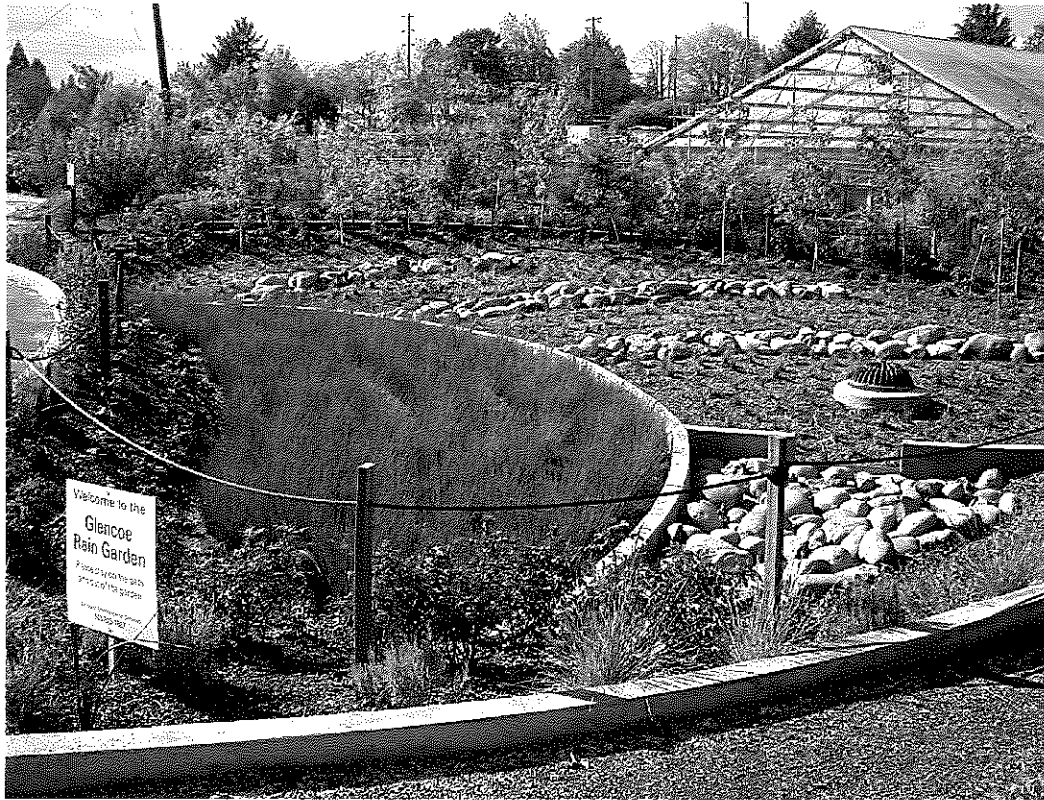
At Portland's Glencoe Elementary School, the Raingarden collects parking lot stormwater into a bed filled with sedges ( Carex spp.) to biofilter the pollutants; from there, the water passes through a series of stepped terraces that slow the movement and allow it to infiltrate the soil.

development. In Seattle's "Street Edge Alternatives," winter rains are captured in gently graded bioswales that have been planted with flowering perennials along the street's margin; the straight street has been given a sinuous curve to slow down traffic. In Portland, Ole Ersson captures rainwater from his roof, and keeps his family of four in drinking water year-round. In the Glencoe Raingarden in Portland, petroleum-polluted parking lot water is biofiltered with sedges and allowed to recharge the ground-water. At Cabrillo College in Aptos, California, the landscape around the buildings and parking lots of the new Horticulture Department includes a retention pond to collect storm-water; there, it is bio-