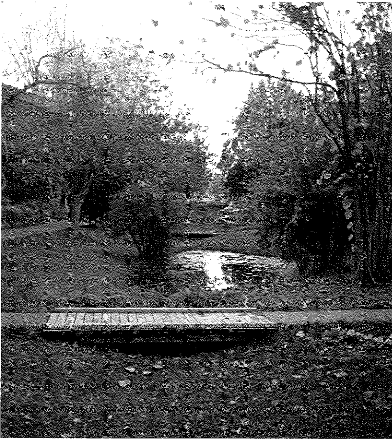
An infiltration basin installed in the late 1970s as part of the natural drainage network at Village Homes subdivision in Davis, California.