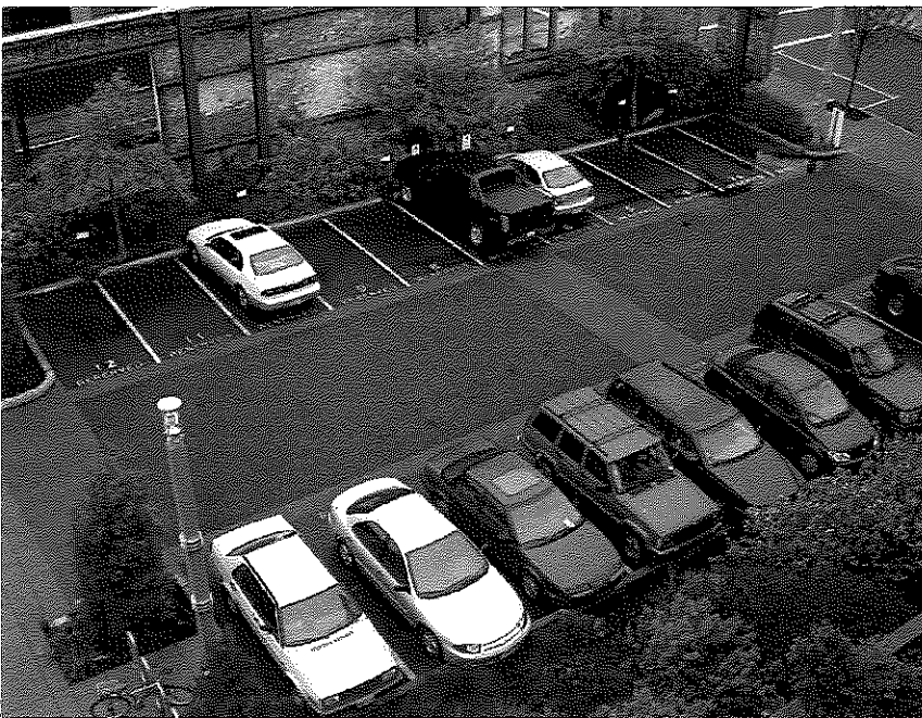
A parking lot at the EcoTrust Building in Portland, Oregon, where petroleum-polluted rainwater drains into adjacent sunken beds planted with native trees and shrubs; there, it is filtered and allowed to replenish the groundwater