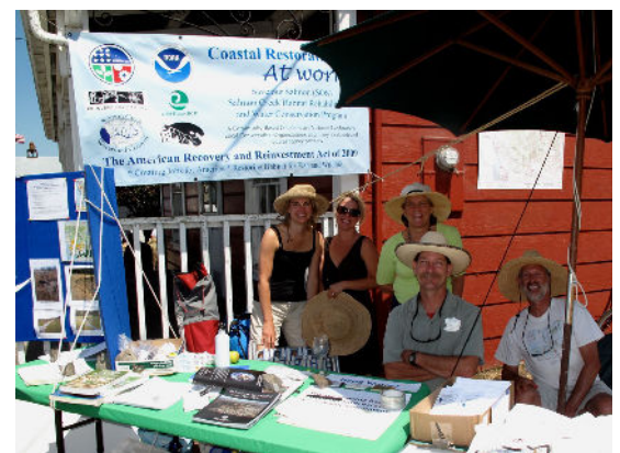
TOP TO BOTTOM: Gilardi Ranch, Bodega Valley; project signage; community outreach.