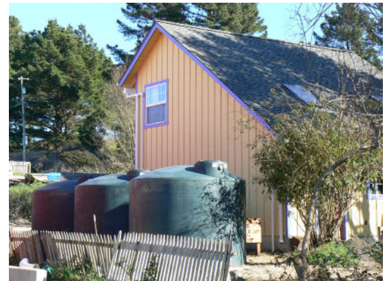
TOP TO BOTTOM: Gilardi Ranch catchment installation; Bodega Volunteer Fire Department storage tank; private residence roofwater harvesting system.