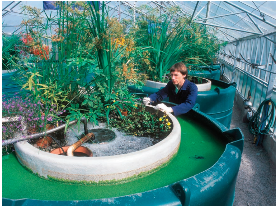
IN THE SCOTTISH ECOVILLAGE FINDHORN, THE COMMUNITY’S WASTEWATER IS PURIFIED THROUGH A TREATMENT PROCESS THAT INVOLVES VARIOUS TANKS.

As I make my way back to the city, through the back roads of Sonoma County, I suddenly start noticing all the creeks draining that beautiful patch of earth. Salmon Creek, Ebabias Creek, Estero de San Antonio... one