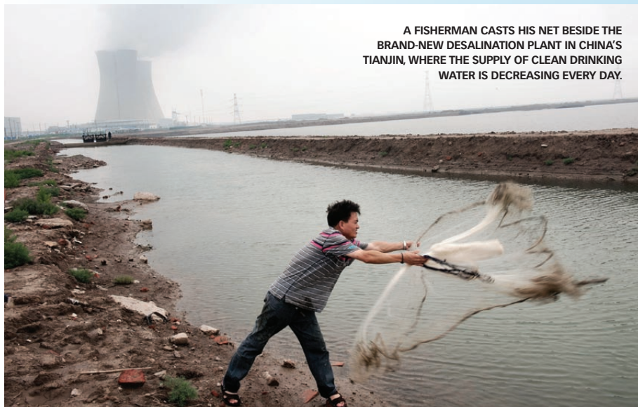
A FISHERMAN CASTS HIS NET BESIDE THE BRAND-NEW DESALINATION PLANT IN CHINA'S TIANJIN, WHERE THE SUPPLY OF CLEAN DRINKING WATER IS DECREASING EVERY DAY.

But ultimately, China sees its investment in desalination as important to its future: it will help ensure that the country doesn’t, quite literally, dry up. | ELLEKE BAL